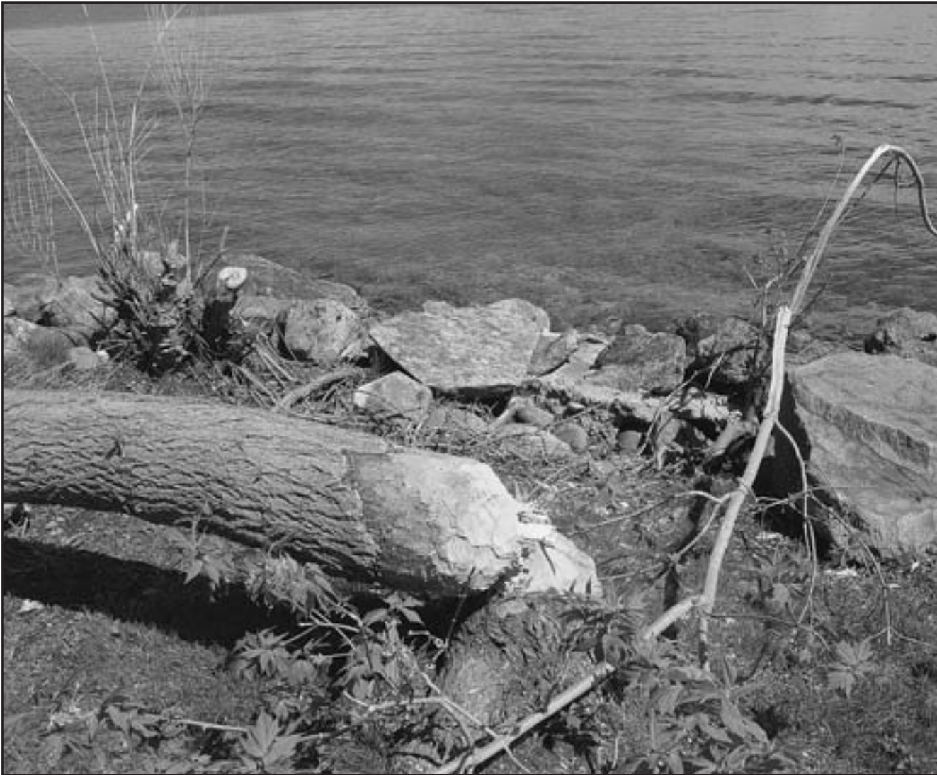
A few weeks back, The Scope published a photo of the beavers that were found along the 7th Line. They are also making the presence known in the Big Bay Point area, coming on shore and having a snack or two. Remember not to approach the animals, and if you are boating in the area, watch out for them.

Although the Parks Department originally estimated $90,000 as their cost for this equipment, the figure was reduced to $70,000 as a capital request cost saving measure. The total cost of the three parts is $76,580.88. The $6,580.88 will be funded through Equipment Reserves.