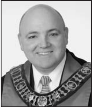
Warden Tony Guergis By Tony Guergis Warden, County of Simcoe

As you can see all around you every day, Innisfil and Simcoe County continue to grow at a rapid rate. Home construction dots the landscape, new businesses are moving into the area, and cultural and recreational amenities are being added to neighbourhoods enhancing our lives.